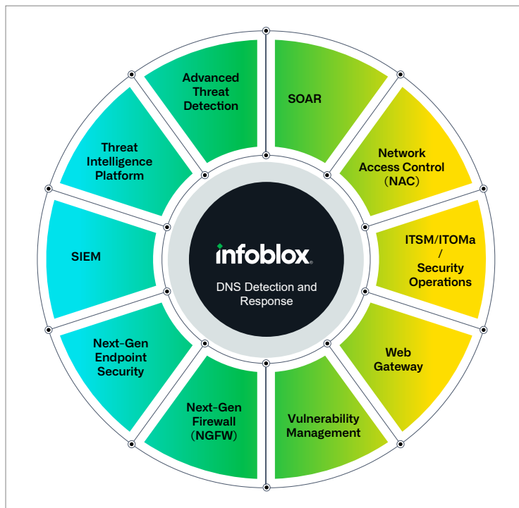
Figure 2: BloxOne Threat Defense integrates with the entire cybersecurity ecosystem

Senior System Administrator and Network Engineer, City University of Seattle